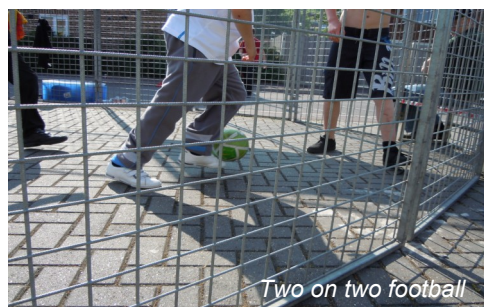
Two on two football